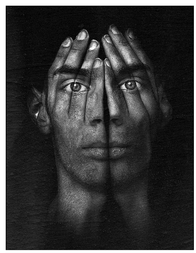
"Insomnia"

"We Wear the Mask" by Paul Laurence Dunbar (1896) is in the public domain.